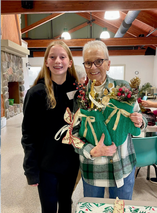
WHS PALs helped with Christmas Craft!