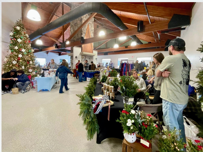
The Holiday Market!