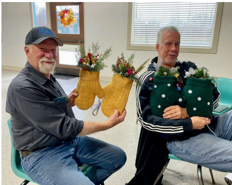
Even the guys made our Christmas craft!

The WASC shall provide educational, enrichment, health awareness, and social programs; shall serve as a resource for individuals needing assistance with medical and social service networks; and shall collaborate with other community agencies, local government, and trained professionals to meet the needs of the senior population.