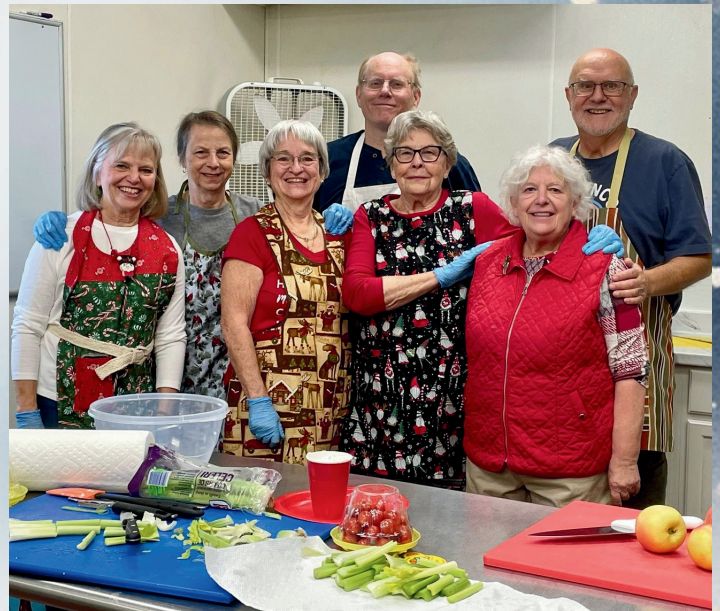
Our Thursday Kitchen Crew!