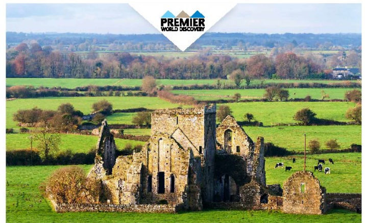
Treasures of Ireland October 22, 2024, 9 days