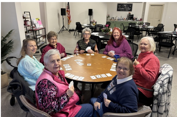
The Ladies playing cards in the morning.

The WASC is now located at 500 Williamston Center Rd. in Williamston, Michigan 48895. We have reserved (handicap) parking/access and automatic front doors.