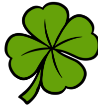
Join us for lunch!