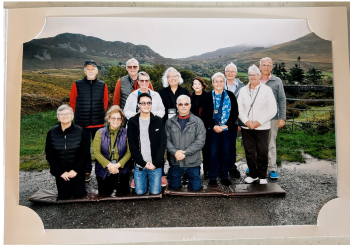
Members and friends who went on the Ireland trip October 2024.

**See Reservation Info for Booking Discount details