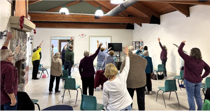
Exercise class, Monday, Wednesday, and Thursday @ 10:30am!